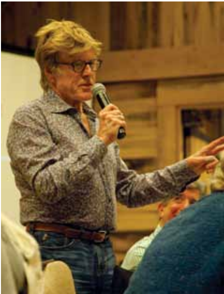
Robert Redford speaking to participants of the Greening of America's Schools Summit.

"In my mind, the issues we are facing in the environment and education are inextricably linked, and I believe that this convening can lead to creative ideas and bold solutions and that people like you are key to creating them."