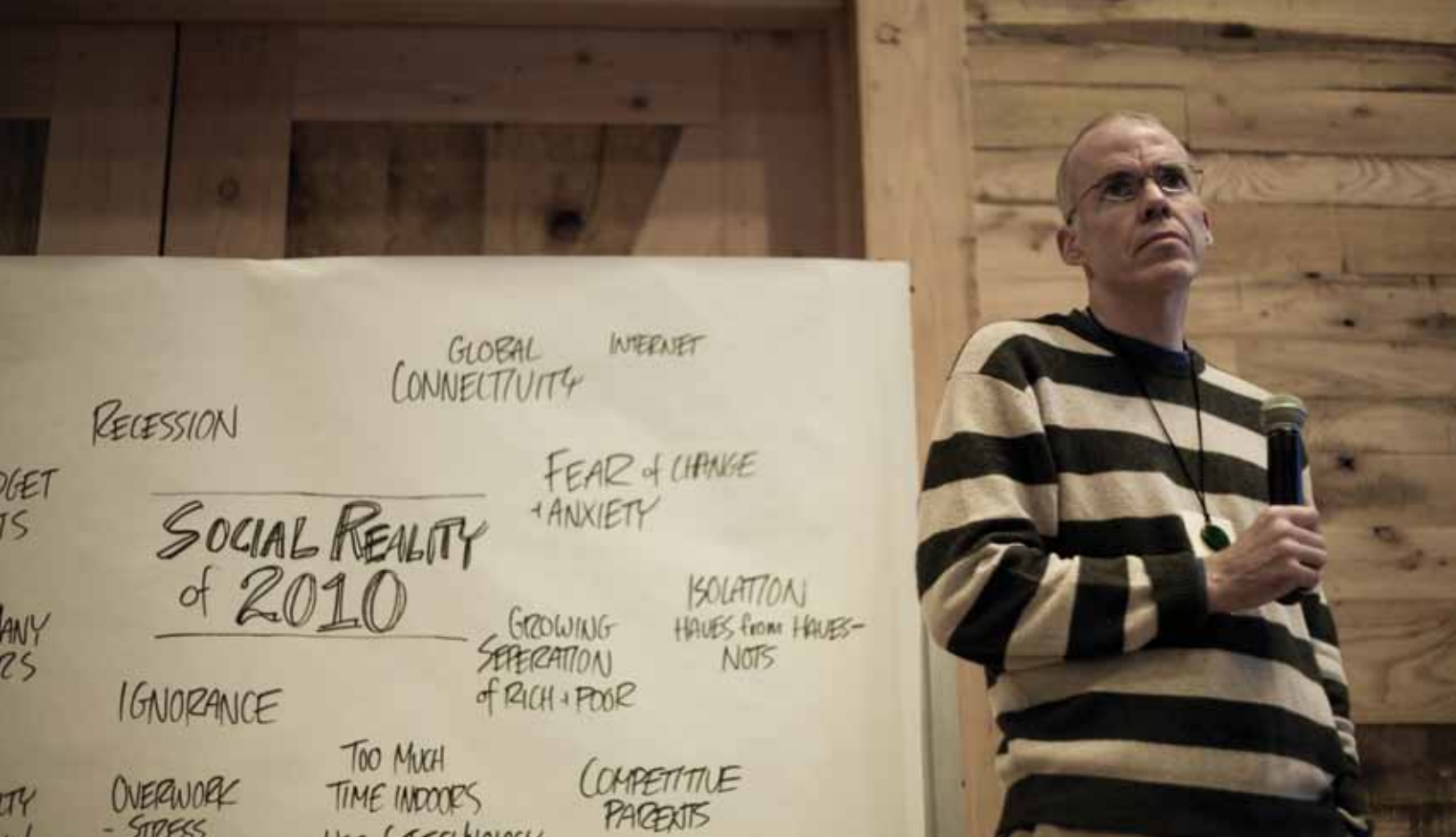
Author, speaker and environmentalist Bill McKibben addressing attendees of the Greening of America's Schools Summit at Sundance.