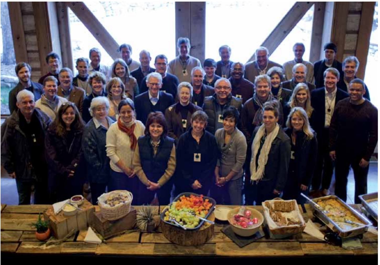
Participants of the 2010 Greening of America's Schools Summit

For more information visit: www.epa.gov/iaq/schools