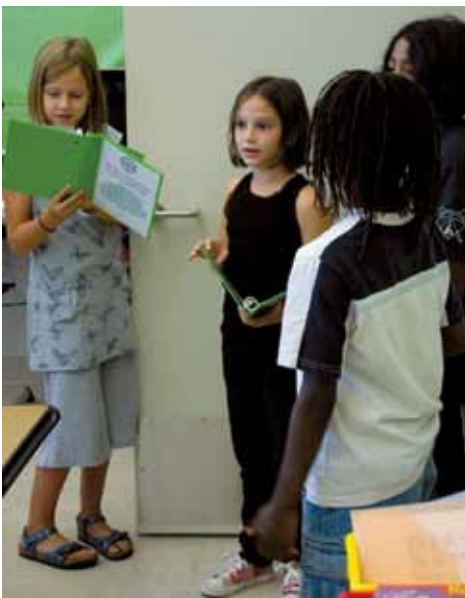
Students at Stoddert Elementary in Washington, D.C., giving green school tours.

Take community leaders and stakeholders on a tour of a green school and ask your local AIA or USGBC chapter to help organize it. Tours are an excellent way to increase awareness and generate community support. In some green schools, students serve as the tour guides, highlighting the waterless urinals, explaining the eco-friendly features and underscoring the unique design.