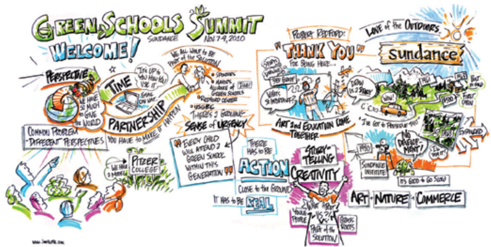
Graphic Recorder Jim Nuttle captured the outcomes of the Greening of America's Schools Summit through visual illustrations. ILLUSTRATION COURTESY OF JIM NUTTLE

We meet this challenge by working collaboratively on the local, state and federal levels and among key stakeholders, including teachers, students and parents, to support green schools policies and practices.