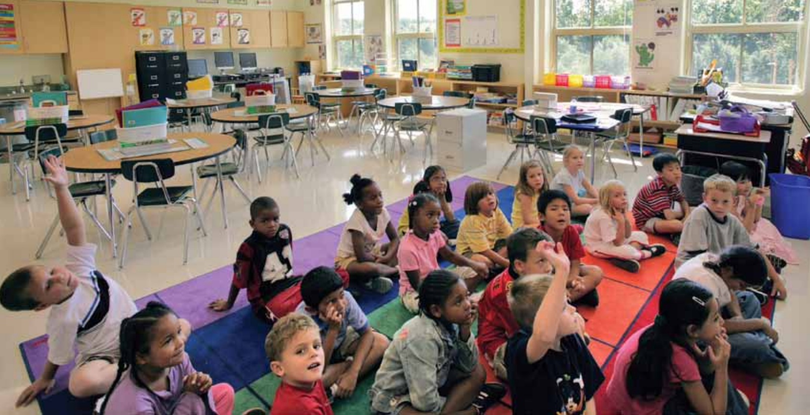
Great Seneca Creek Elementary School, Germantown, Md.