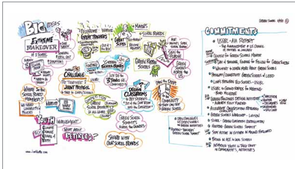
ILLUSTRATION COURTESY OF JIM NUTTLE

The Local Leaders in Sustainability: Special Report from Sundance outlines a national action plan that mayors and local leaders can use as a framework to develop and implement a green schools initiative. The report also provides a comprehensive review of the benefits of green schools; a summary of local, state and federal policy solutions; leadership profiles of green school advocates; and case studies from both large cities and small communities. Together, these resources can serve as a roadmap to begin your journey to green your community's schools.