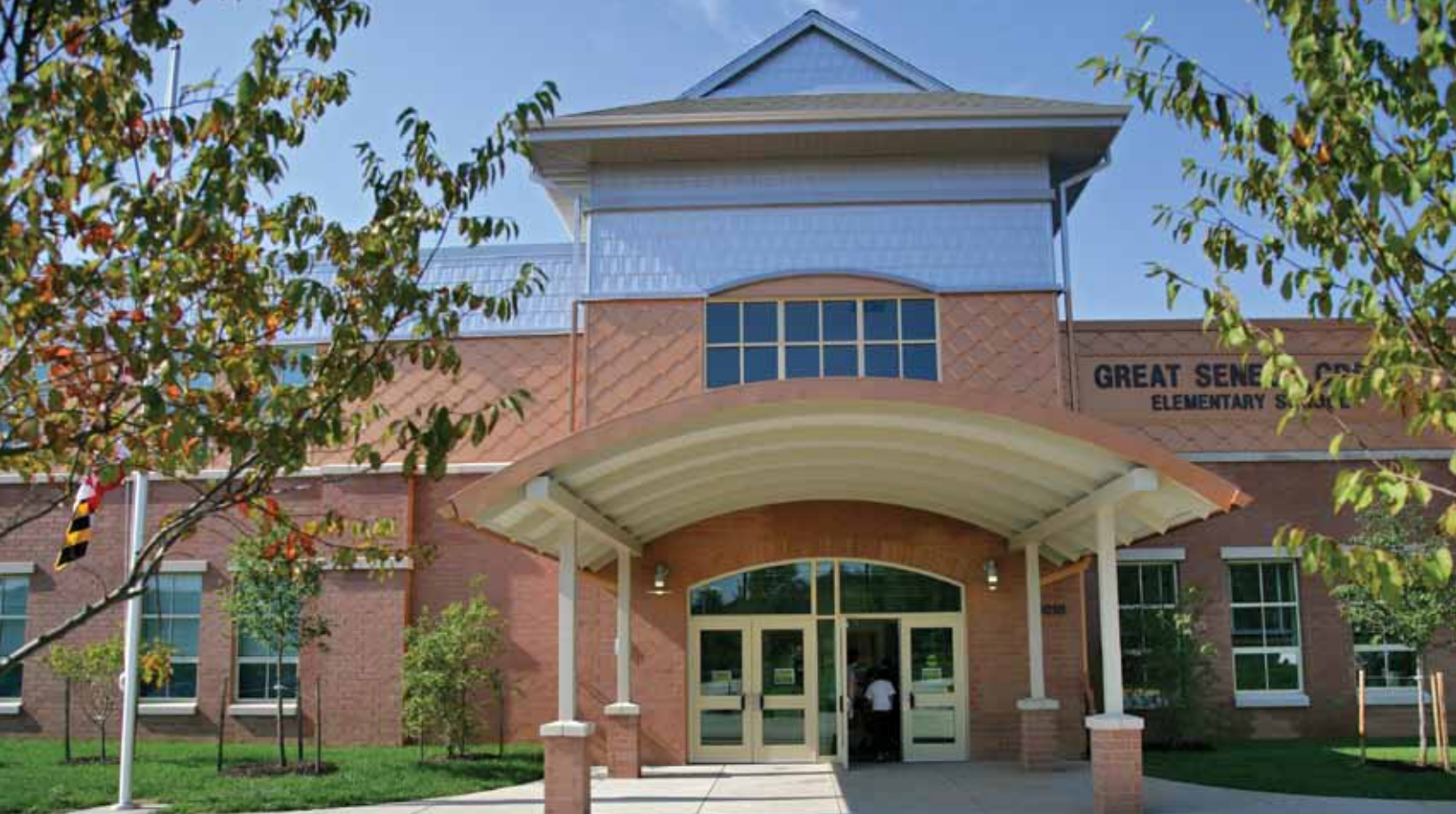
Great Seneca Creek Elementary School, Germantown, Md.