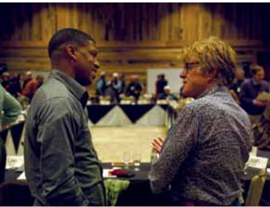
Mayor Johnson with Robert Redford at Sundance

In his 2011 State of the City Address, Sacramento Mayor Kevin Johnson prioritized green schools as a key strategy for long term success. Mayor Johnson, an attendee of the Greening of America's Schools Summit and member of the Mayors' Alliance for Green Schools, understands that green schools create a foundation for children to excel.