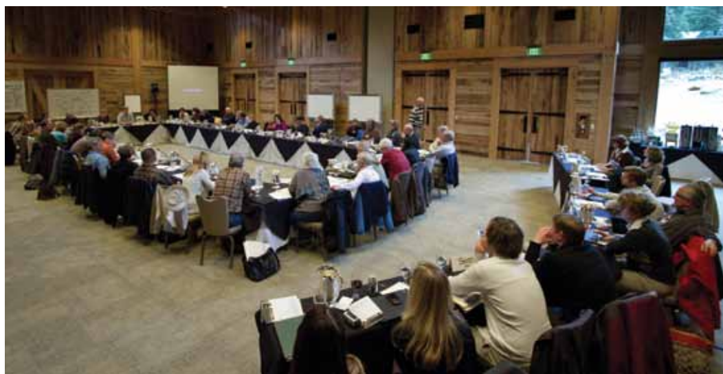
Participants at the Greening of America’s Schools Summit at Sundance, Utah

By inviting the community to be part of the collaborative process to green a school, and by including them in on-going sustainability initiatives, a green school can become a source of civic pride. Local horticulture experts can be invited to conduct research with biology students on native plants and how they can save water, builders and facilities managers can help students in math class track the energy savings generated from the use of solar panels and students can plan community-wide recycling programs based on the success of their own school’s efforts. Students can become green ambassadors, educating their family, friends and community about the value of going green. The school’s website can provide an opportunity to share the school’s green initiatives with the community, including tracking the school’s reduced utility costs, highlighting the pounds of trash sent to the recycling center and showcasing sustainability programs that are bringing the school and community together.